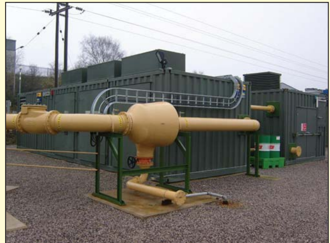
KS Cyclone Separator - Protection of Gas Compressor Inlet

Site visits can be arranged and units custom designed to suit specific applications.