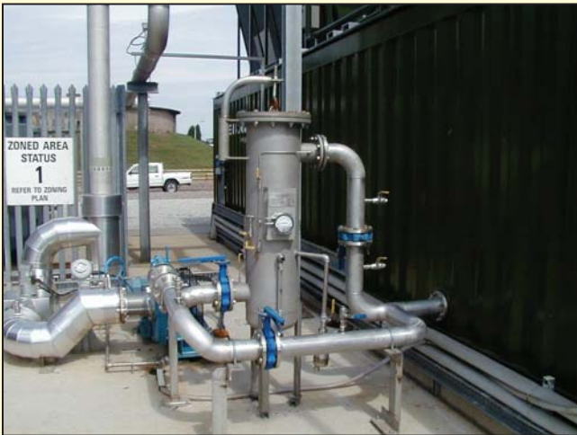
Fuel Gas - Liquid / Solid Separation

KELBURN ENGINEERING LTD has over 20 years experience in the design and manufacture of separation and filtration equipment for the efficient removal of contaminants found in flows of LANDFILL, SEWAGE, BIOGAS and MINES GAS including coal mine and coal bed methane used as fuel for power generation.