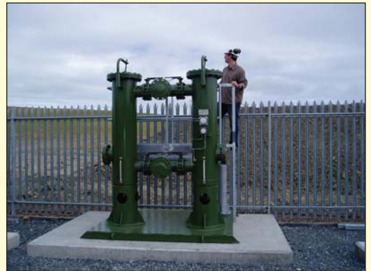
Duplex Arrangement Coalescer Filter Skid