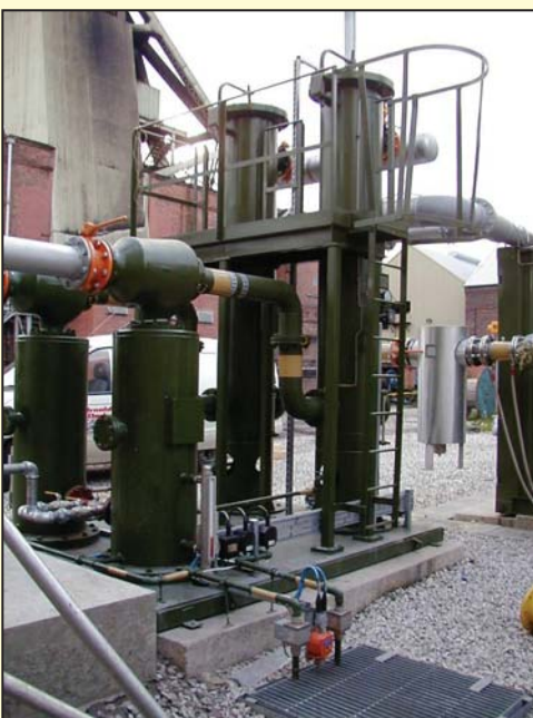
Mines Gas Cyclone Separation Coalescer Filter Skid