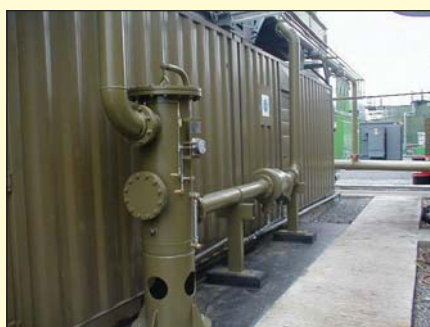
Reciprocating Gas Engine Removal of Liquid / Solid from Fuel Gas Line